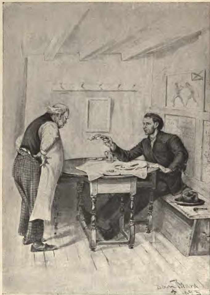
"GIVE ME THE CHANGE, PLEASE."